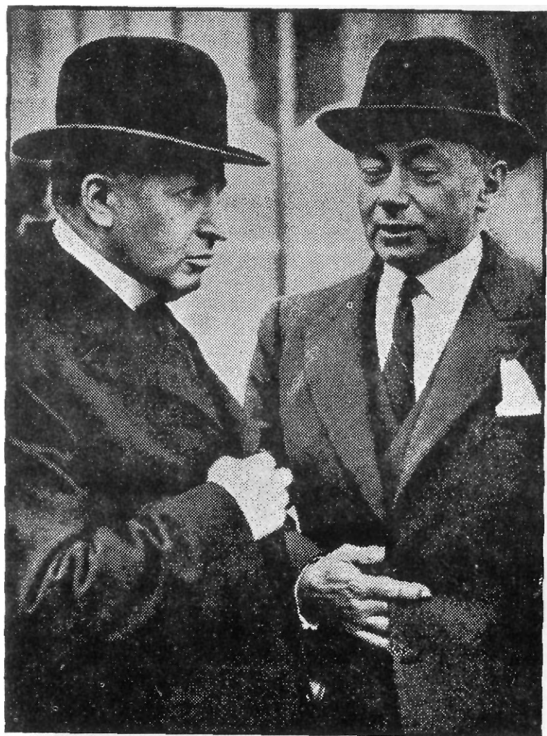
Georges Mandel and Paul Reynaud.